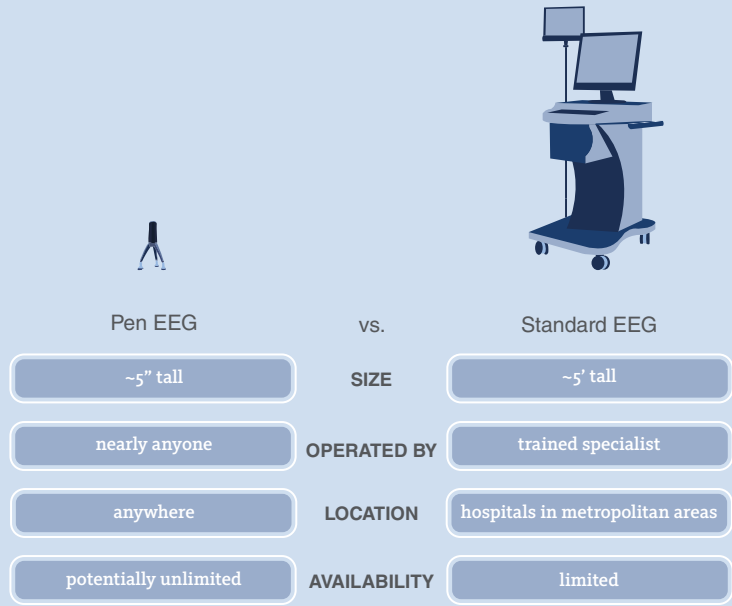
Graphic: Elisa Le

According to a 2019 study, traumatic brain injury (TBI) is a leading cause of death and disability, contributing to about 30 percent of all injury-related